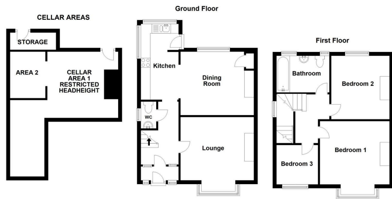
This plan is to be used only as an indication of the floor layout and is not to scale. Plan produced using PlanUp.